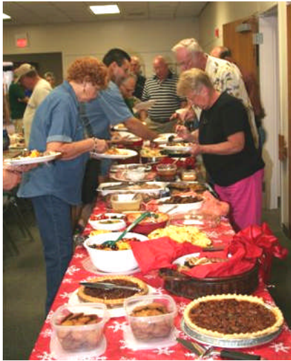
We filled up three tables with treats.