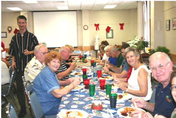
Great time was had by all.